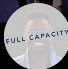
SHADDY MELU CHURCHOME, KIRKLAND JUNE 14 - 17