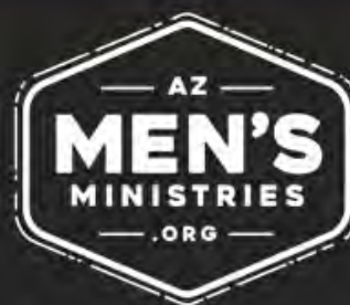
ARIZONA MEN'S MINISTRY TEAM